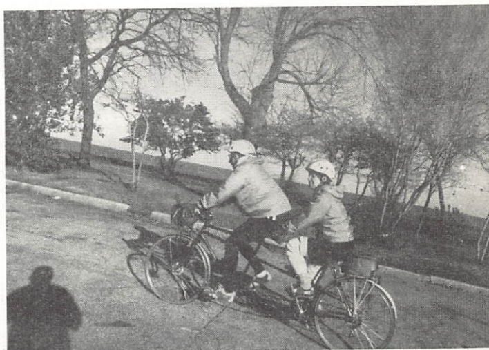
Jim and Myra Baum - beautiful biking along Lake Michigan shore.