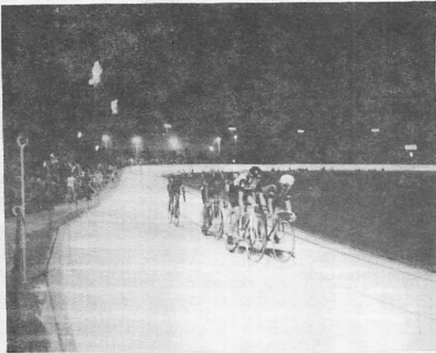
WE SPEND A NIGHT AT THE NORTHBROOK TRACK