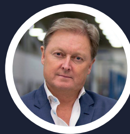
Henrik Fisker US Keynote Speaker